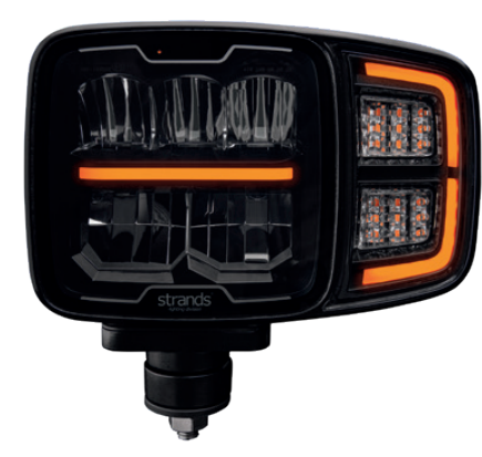
Part No. 270717