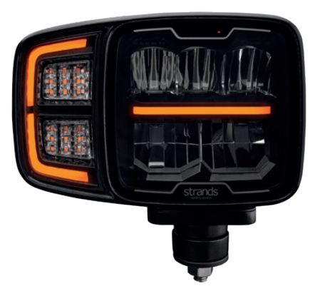
Part No. 270716